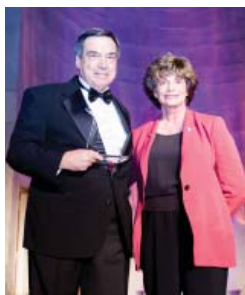
FERC Commissioner Wellinghoff and Rep. Shelley Berkley