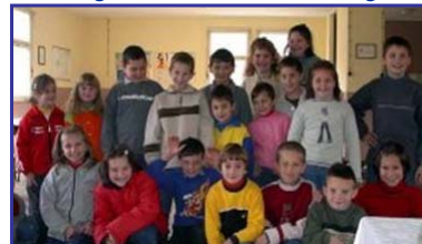
Green Schools Program in Serbia