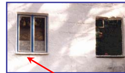
New, Efficient window