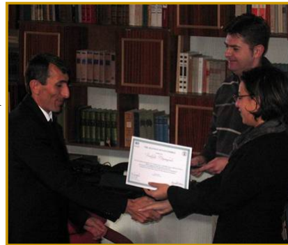
Mayors' Training in Municipal Energy Management and Building EE