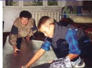
Moldovan children weatherize their boarding school