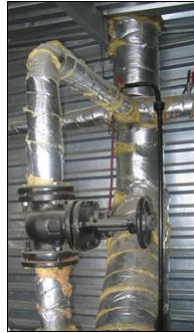
Weatherizing heating pipes