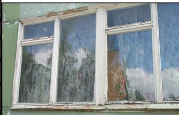
Common state of windows in CIS countries