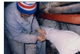
Insulation of water pipes