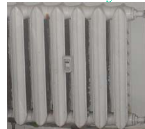
Heat Cost Allocator