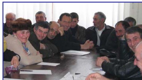
Training of Condominium Managers