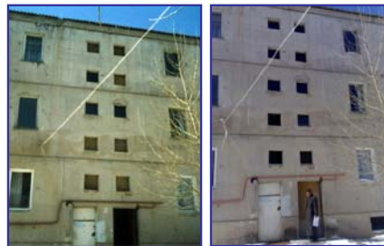
Before project (most windows have no glass) After Project (all windows are glazed)