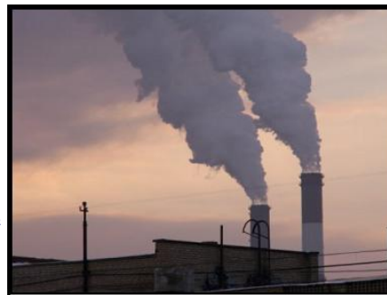
Waste heat releases