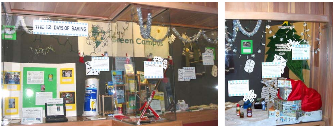
Above: The library's main display case, located on the first floor, will exhibit Green Campus' "12 Days of Savings" until Tuesday, December 12 th . The Tree of Sustainability, shown right.

In the Library's main display case, located on the first floor, you will find Green Campus's "12 Days of Savings" exhibit. Despite the shameless Christmas spoof, the exhibit attempts to present itself in a non-denominational fashion. In the spirit of the Holidays, the exhibit promotes and provides examples of energy conservation and sustainable practices.